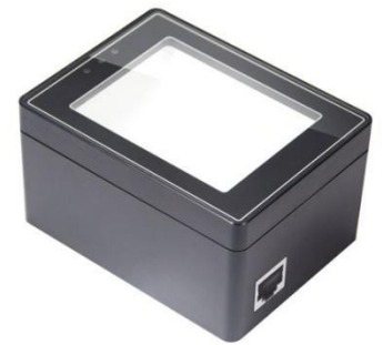
RTX200-C on-counter version

Presently, more and more access control system begins to mix bar code reading and NFC reading together, what's more, wireless data transfer become a trend for access control. The RTX200 serial aims to this kind of application and the trend, it's outstanding in: