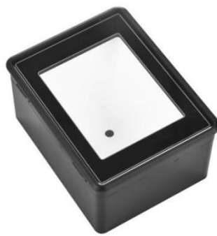
RTX200-A External embedded version