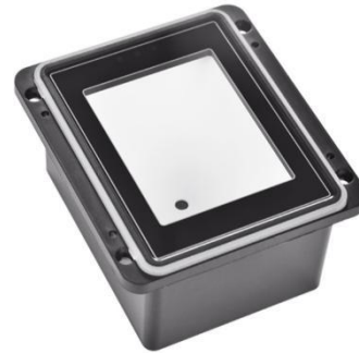
RTX200-B internal embedded version