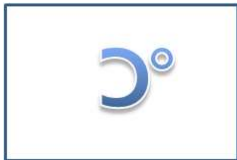
Fig.9-2 Horizontal Flipped Image