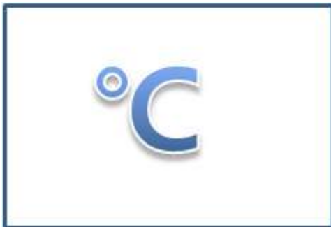
Fig.9-1 Standard Image