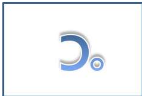
Fig.9-4 Horizontal and Vertical Flipped Image